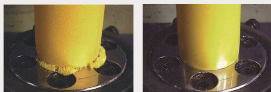
Without adding "N-30"